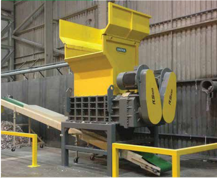
RDF Fine Shredder Size Reduction to 50-80mm